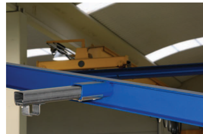
BEAM WELDED SUPPORT